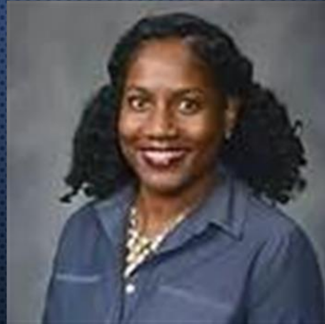
Faith Royal Last Names L-Z