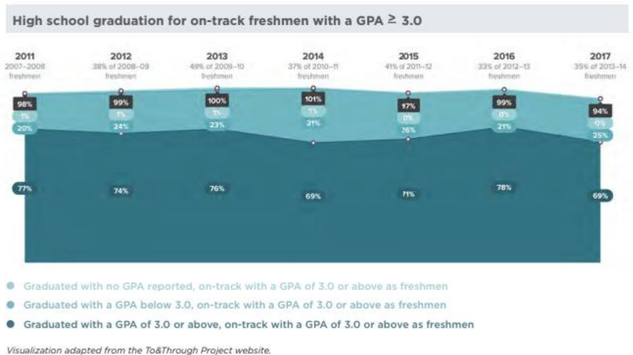
Figure 8: Changes over Time in High School Graduation for Different Groups of Freshmen at Sample School